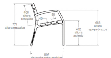
vista lateral 1:20