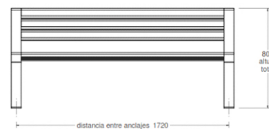
vista alzado 1:20