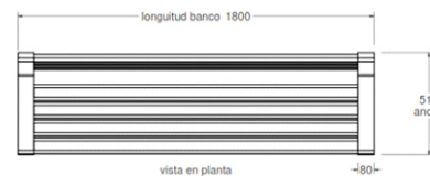
vista en planta 1:20